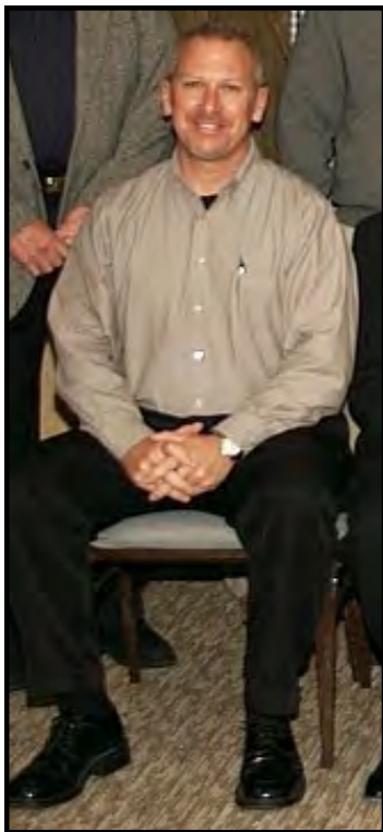
appointment as President