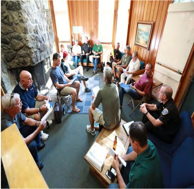
Board Members prepare for the conference at the Wednesday afternoon board meeting at Pilgrim Pines in Oak Glen.