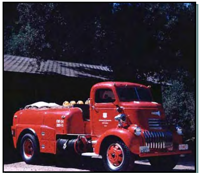
USFS Rincon Tanker 311 in front of the Rincon Station, San Gabriel Canyon, Angeles National Forest.